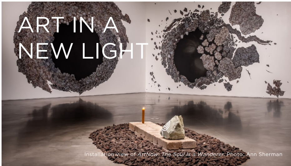
Installation view of ArtNow: The Soul Is a Wanderer.

ALL ARE WELCOME. To stay in the loop join our mailing list and follow us on social media.